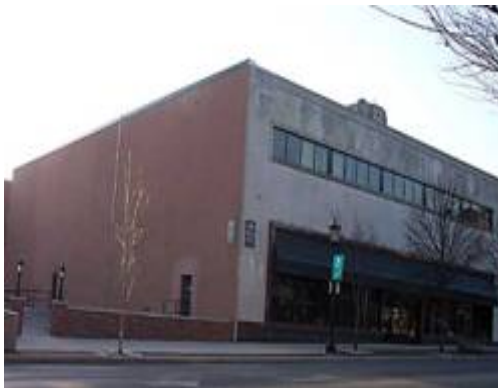
Seneca County General Health District 71 S. Washington St., Tiffin

staff, after numerous hours of training on the new sewage regulations, which went in effect January 1, 2007, are ready to answer your questions. If you plan new construction or replacement septic, please contact the division for proper